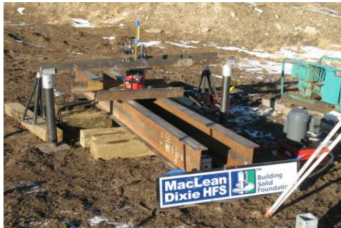
Full scale field testing-compression/tension/lateral

MacLean-Dixie Helical Piles and Anchors undergoing rigorous testing at an IAS accredited lab to ICC AC358 Acceptance Criteria For Helical Foundation Systems and Devices. Ongoing quality control program per AC10 with inspections by an IAS accredited inspection agency per AC98