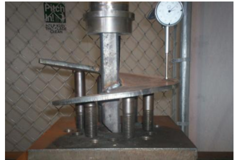
Helix Strength Test