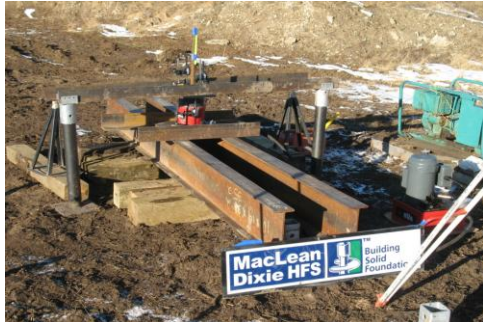
Full scale field testing- compression/tension/lateral

MacLean-Dixie Piles and Anchors undergoing rigorous testing at an IAS accredited lab to ICC AC358 Acceptance Criteria For Helical Foundation Systems and Device. Ongoing quality control program per AC10 with inspections by an IAS accredited inspection agency per AC98