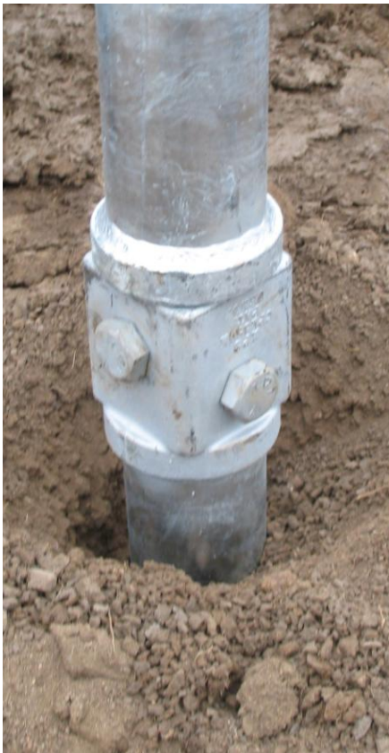
2-bolt Cross Connection

MacLean-Dixie "Strength Squared™" coupling system (Patent pending)